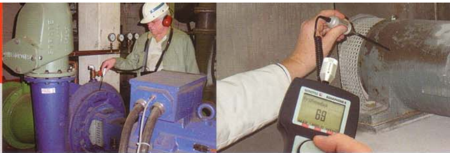
First signs of wear in sliding or rolling bearings are easily detected using body sound detection technology.